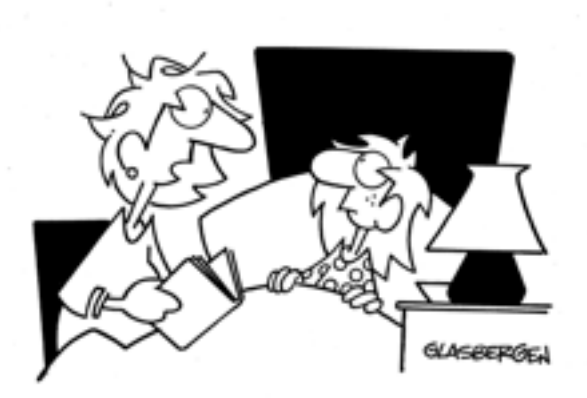
"Yes, the disciples followed Jesus... but not on Twitter."