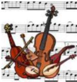
The Presbyterian Pickers

Please join us for a delicious supper provided by Rose Hill Restaurant and live entertainment will be provided by The Presbyterian Pickers. We know you will enjoy the fellowship, food and music!