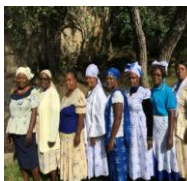
World Day of Prayer Zimbabwe Committee