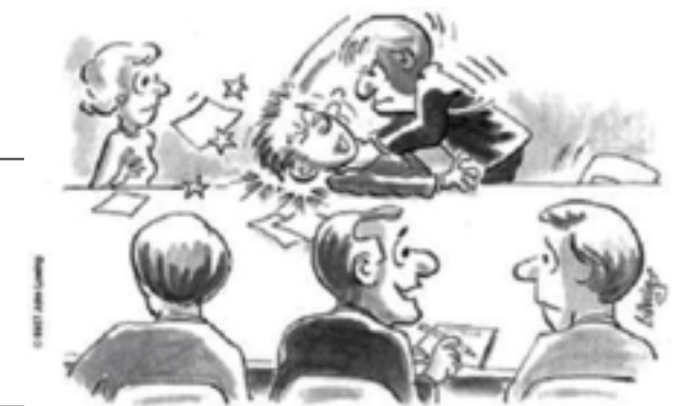
"In the minutes, should I record this as a 'vigorous theological discussion' or a 'serious ecclesiastical debate?'"