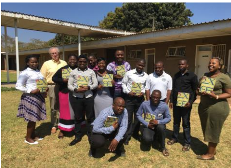
BOOKS FOR ZAMBIA PROJECT Offering on Sunday, October 6 World Communion Day Goal: $1,100

On World Communion Sunday, October 6, we have the opportunity to support the preaching of the Gospel in southern Africa. We will take up an offering to purchase Hebrew and Greek textbooks and dictionaries for students studying for the ministry at the Justo Mwale Theological University College in Lusaka, Zambia. The offering goal is $1,100, which will cover the cost of the books and shipping.