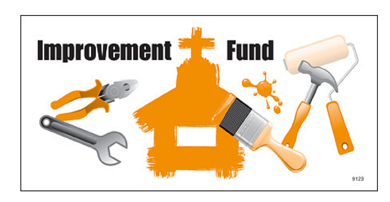
5TH SUNDAY BUILDING OFFERING SUNDAY, OCTOBER 30

This offering provides school lunches and weekend food for students in Duplin County Public Schools. Thank you for your generous and faithful support.