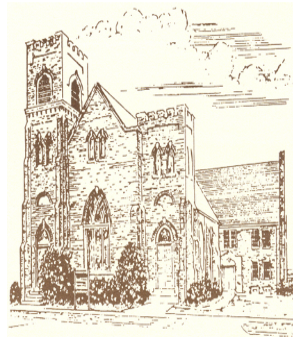
Organized in 1884