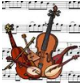
The Presbyterian Pickers

Please join us for a delicious supper provided by Rose Hill Restaurant and live entertainment will be provided by The Presbyterian Pickers. We know you will enjoy the fellowship, food and music!