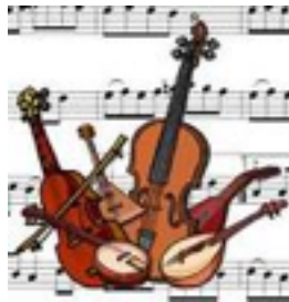
The Presbyterian Pickers

Please join us for a delicious supper provided by Rose Hill Restaurant and live entertainment will be provided by The Presbyterian Pickers. We know you will enjoy the fellowship, food and music!