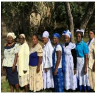
World Day of Prayer Zimbabwe Committee