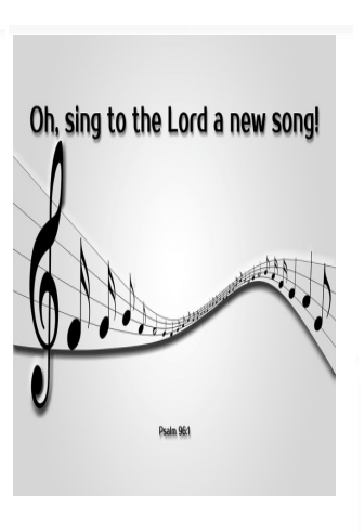
The congregation is asked to remain silent during the prelude as a time of prayer and meditation.