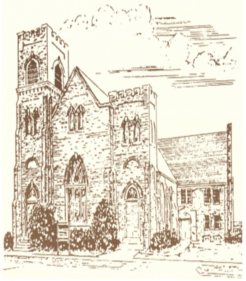
Organized in 1884

THE SERVICE FOR THE LORD'S DAY January 19, 2014 Eleven O'clock in the Morning