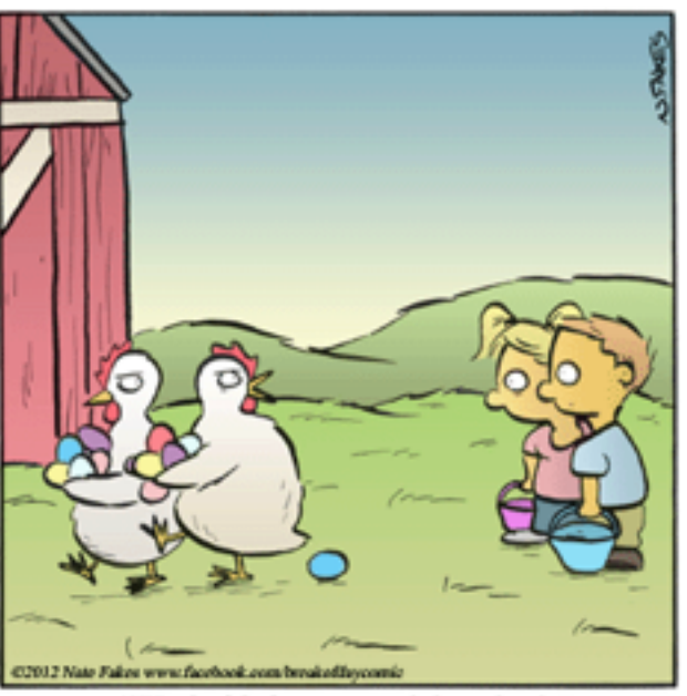
"We decided we wanted these back."